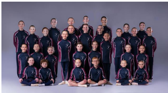
Photo – Dance World Cup team

Please state if ordering girls or boys as the pink is replaced with white.